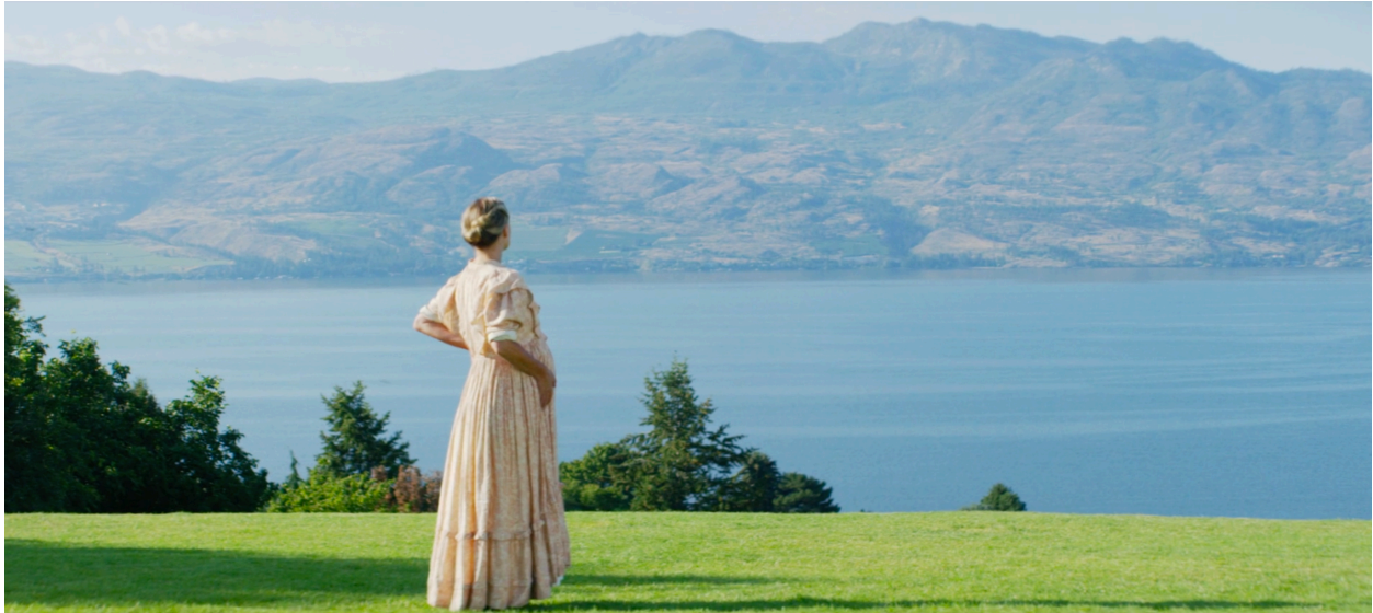
Scene from "The Lake"